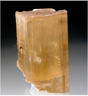
Phosgenite - Monteponi